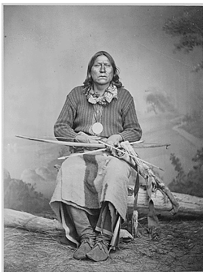
White Bear (Sa-tan-ta), Kiowa.