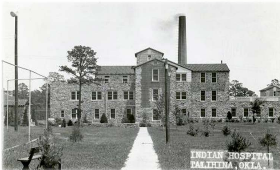
Indian Hospital, Talihina, Oklahoma, ca. 1914-ca. 1936.