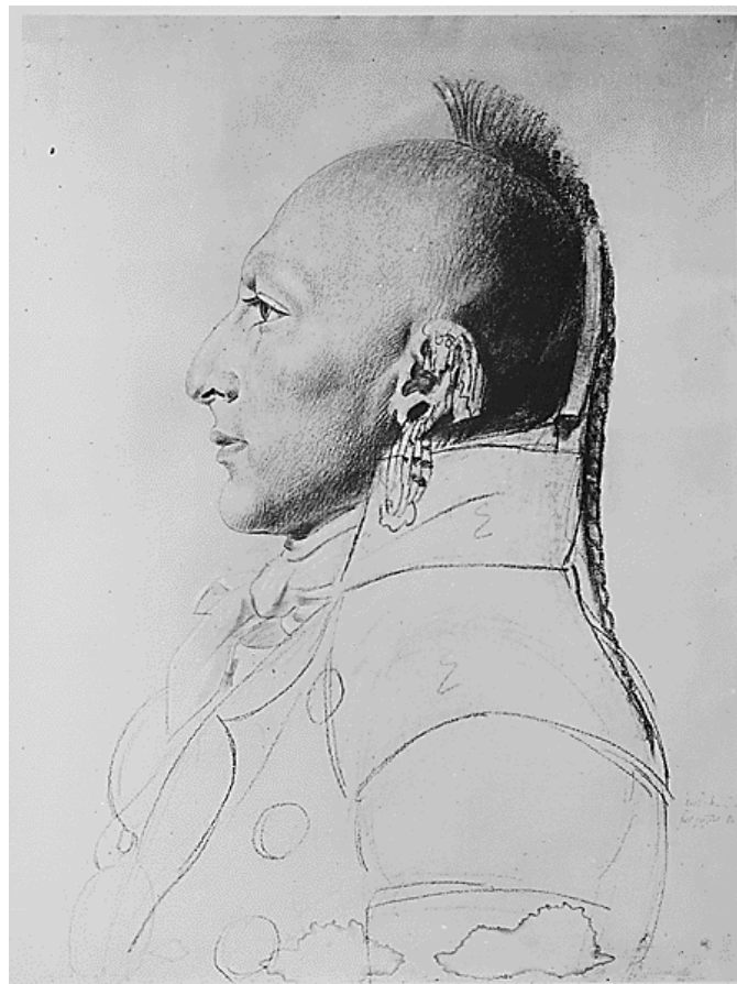
Chief of the Little Osages; bust-length, profile showing hair style, 1807.