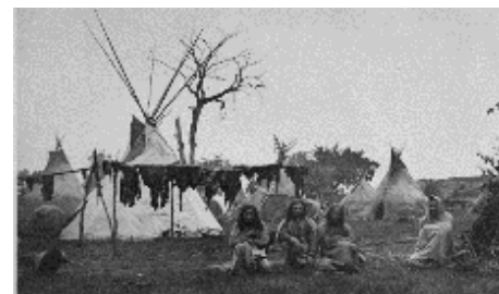
Arapaho camp with buffalo meat drying near Fort Dodge, Kansas, 1870 National Archives. https://catalog.archives.gov/id/518892