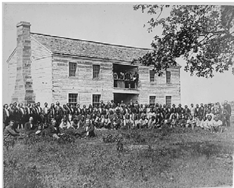
Delegates from 34 tribes in front of Creek Council House, Indian Territory, 1880.