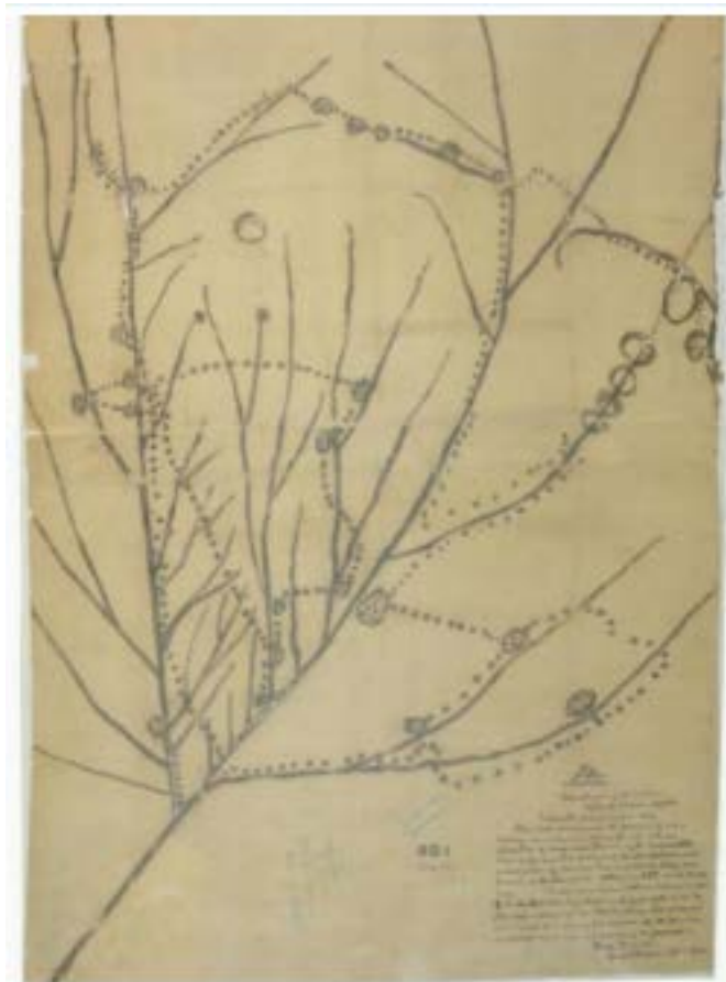
Map drawn by an unidentified Indian and presented by the Sac & Fox of the Mississippi and the Sac & Fox and Ioway of the Missouri in Council with the United States at Washington D.C. on October 7, 1837.