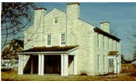
Flint Hills Scenic Byway – The Kaw Indian Mission in Council Grove, Kansas.