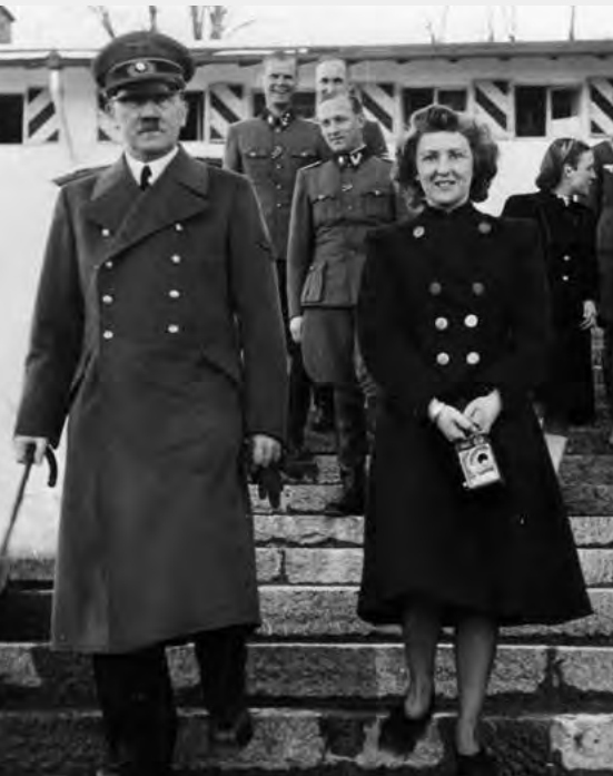
Left: Adolf Hitler and Eva Braun, ca. 1942. Right: A plan of Hitler’s underground bunker near the Reich Chancellery in Berlin, Germany, shows Hitler’s study (A), anteroom (B), bedroom (C), and “map room” (D). Adapted from a plan of the bunker in Hugh Trevor-Roper’s The Last Days of Hitler (6th ed., 1992).