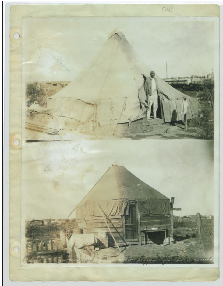
Records of the American National Red Cross. Photo Album of the Tulsa Massacre and Aftermath, 12/1921. National Archives Identifier 157688056 , image 35.