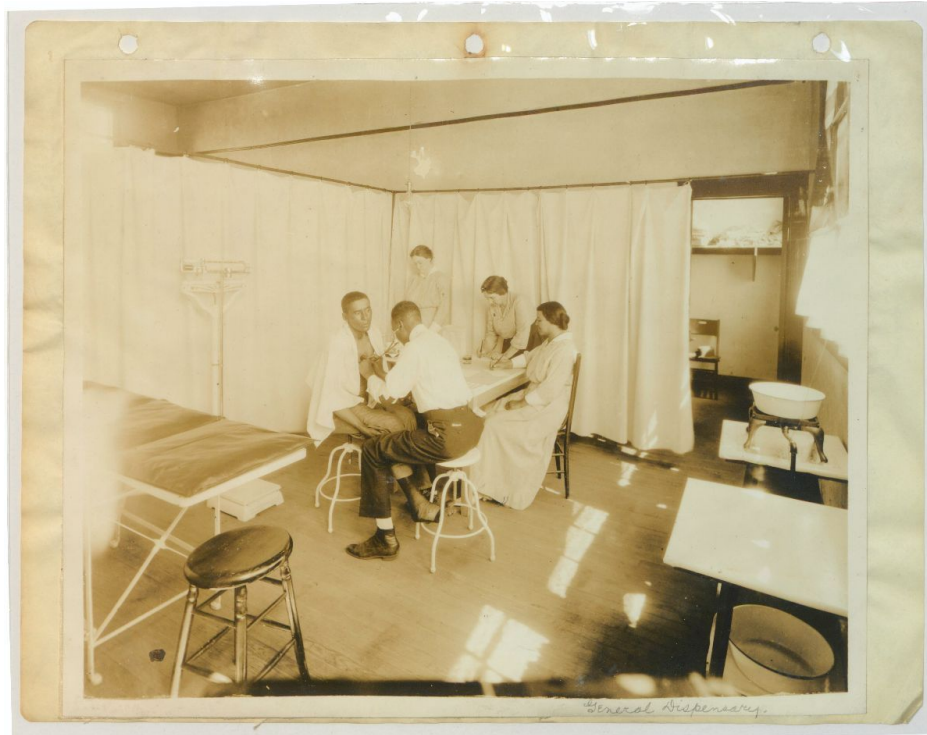
Records of the American National Red Cross. Photo Album of the Tulsa Massacre and Aftermath,