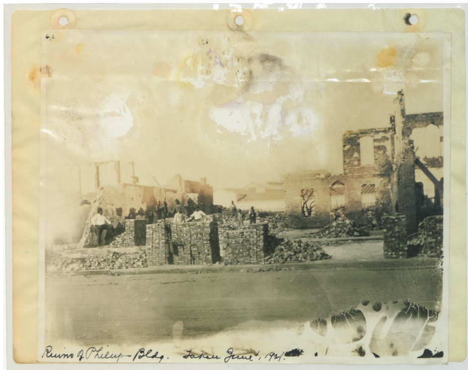
Records of the American National Red Cross. Photo Album of the Tulsa Massacre and Aftermath, 12/1921. National Archives Identifier 157688056 , image 60.

The American National Red Cross provided relief to many victims of this massacre. The Tulsa Chapter compiled reports and a photo album relating to their management of the disaster relief effort. The Red Cross photo album, available in the National Archives Catalog , shows riot scenes, devastated areas, National Guard troops, destroyed homes, dead victims, and massacre survivors in temporary housing.