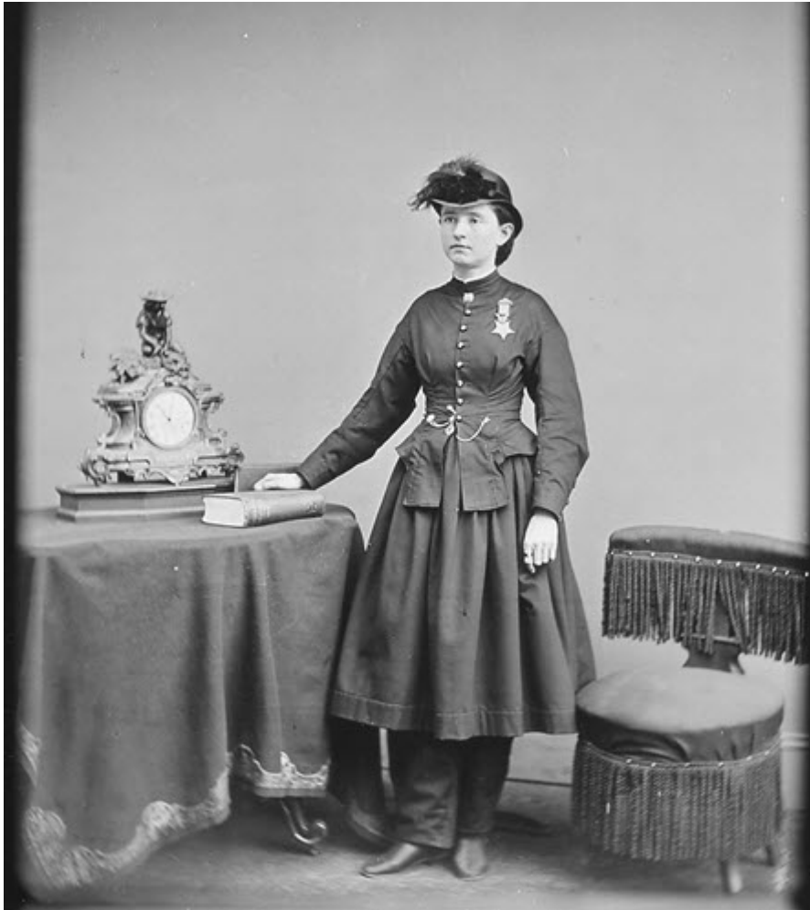
Doctor Mary Walker.

In addition to her many accomplishments as a surgeon, Dr. Mary Walker was a pioneer in women's dress reform. Dr. Walker opposed long skirts and petticoats, particularly due to the dust and dirt they spread as women walked about, so she experimented with shorter skirts layered with trousers and often skipped the skirts entirely in favor of wearing pants. By the 1860s, while a surgeon during the Civil War, Dr. Walker typically wore a knee-length dress with trousers underneath, as pictured here with her Medal of Honor.