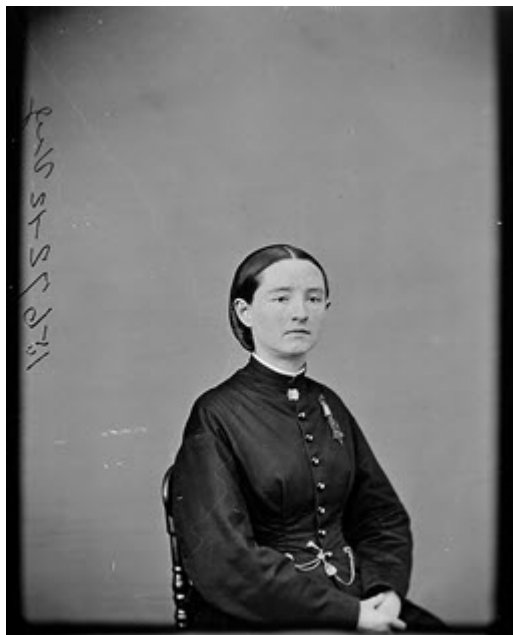
Portrait photograph of Dr. Mary Walker

Dr. Mary E. Walker was born in 1832 in Oswego, New York, to an abolitionist family and graduated from Syracuse Medical College with a doctor of medicine degree in 1855. At the outbreak of the Civil War in 1861, the Union Army did not commission women surgeons, only nurses. Wanting to serve her country, but still wanting to work to her full capacity, Walker volunteered as an unpaid surgeon.