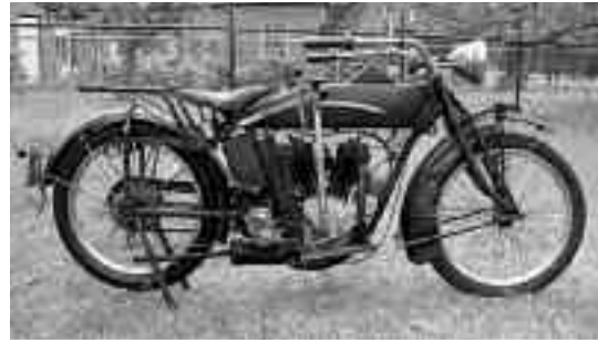
Above: The "type N.E. Indian motor cycle, 1917, Powerplus Twin Cylinder, cradle spring frame, three speed type with complete electrical equipment, including ammeter" used by the Coast Guard in Florida during World War I. The Coast Guard hoped this new technology would enable surfmen to patrol more areas quickly and to return to their posts with news of any sightings as fast as possible.

Although not substantiated in this instance, Wishaar's report appeared to validate the Navy Department's suspicions of at least the possibility that a belligerent power could build submarine bases in or near Mexico.