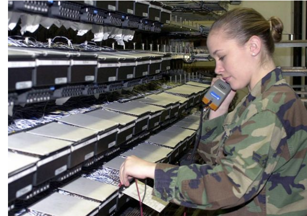
National Archives Identifier 6600730

We are also streaming at https://www.youtube.com/usnationalarchives