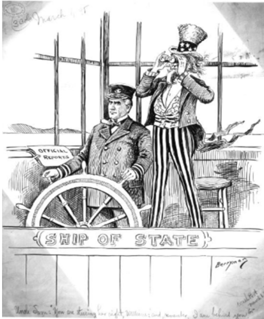
National Archives Identifier 6010252