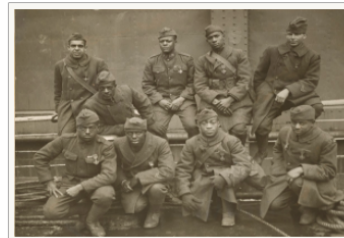
World War I

For the latest updates, subscribe to the Rediscovering Black History blog ! Learn more about the vast amount of records at the National Archives and Presidential Libraries related to the African American experience.