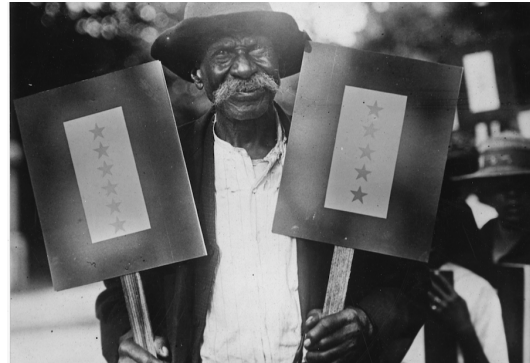
L: Vote Registration Drive National Archives Identifier 556258