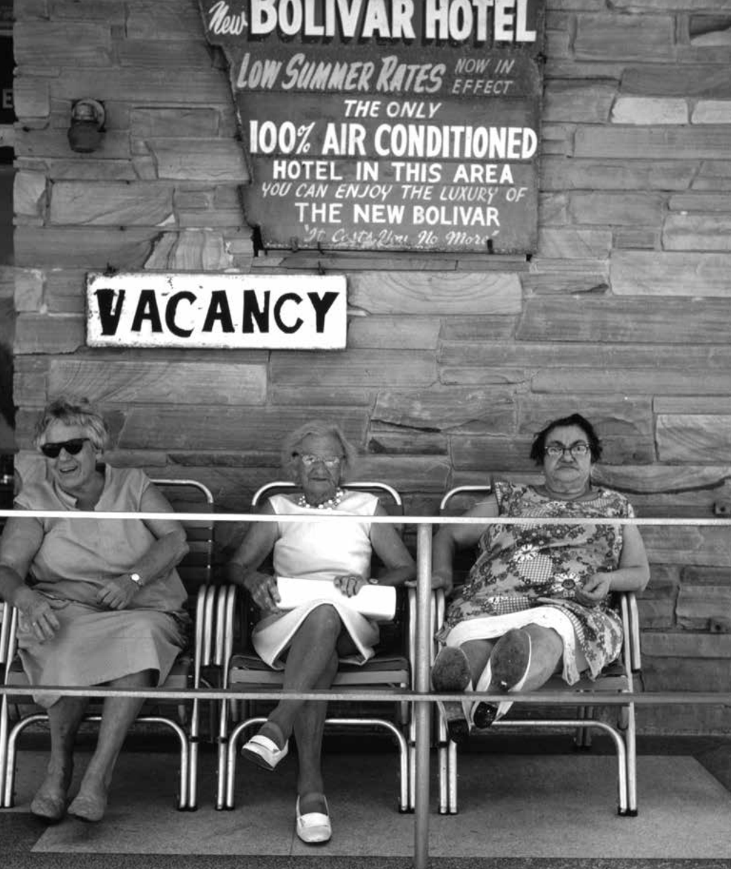
In 1973, this retirement hotel in Miami Beach, Florida, was home for three women photographed by DOCUMERICA photographer Flip Shulke.

polluted rivers. During its lifetime, the project failed to capture America's imagination, but EPA's creation of DOCUMERICA's photographic file and its preservation in the National Archives will give future generations a view of the 1970s that is broad and deep. DOCUMERICA's archive moves us farther from the stereotype of the 1970s as a time when "it seemed like nothing happened," and allows us to glimpse the nascent problems, issues, and changes that would shape our future.