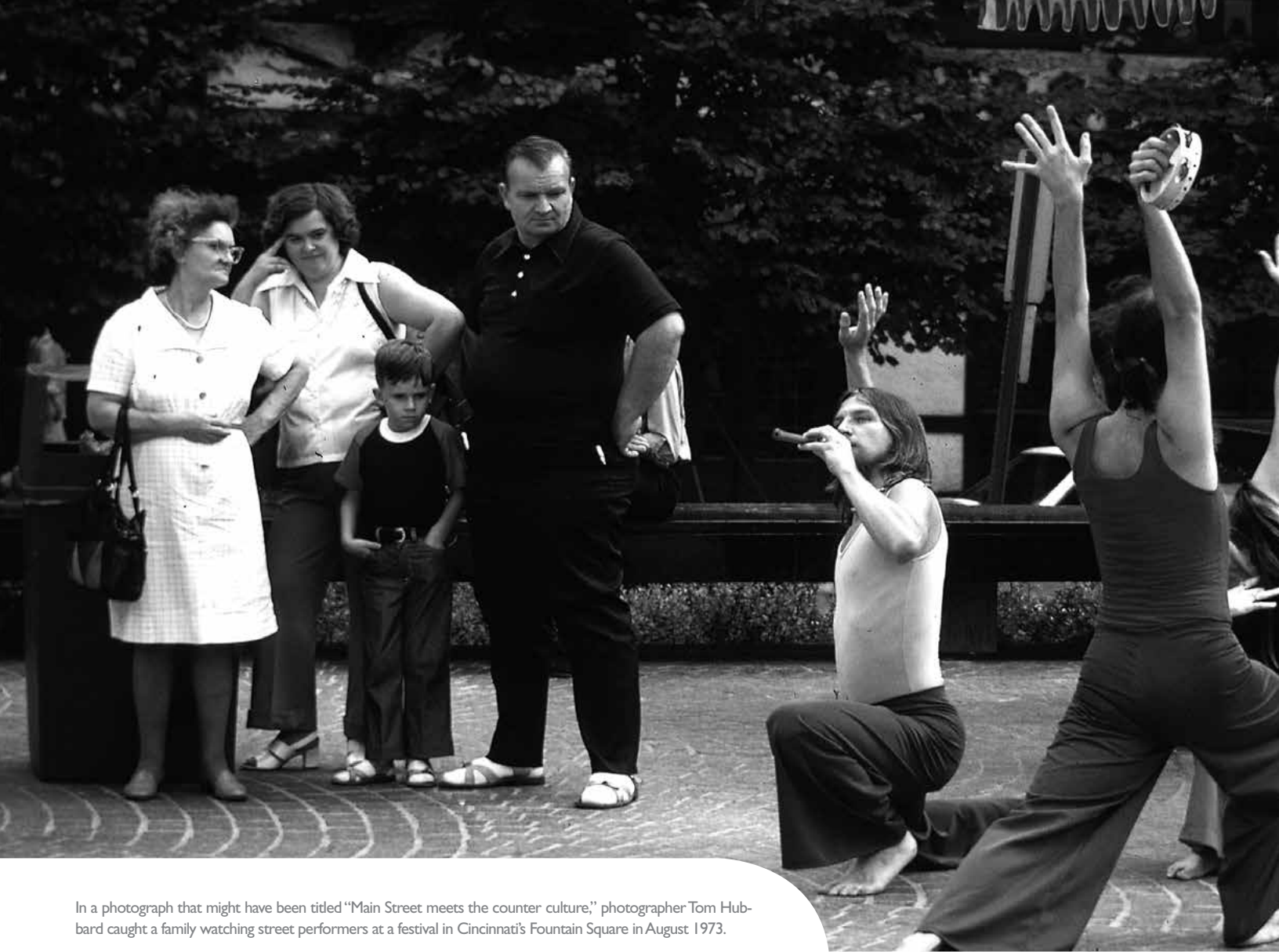
In a photograph that might have been titled “Main Street meets the counter culture,” photographer Tom Hubbard caught a family watching street performers at a festival in Cincinnati’s Fountain Square in August 1973.

Created by the U.S. Environmental Protection Agency (EPA) in 1971, DOCUMERICA was born out of the decade’s environmental awakening and produced striking photographs of many of that era’s environmental problems and achievements. As you might expect, the photographers hired by the EPA took thousands of color photographs depicting pollution, waste, and blight, but they were given the freedom to capture the era’s trends, fashions, and cultural shifts. The result is an amazing archive and a fascinating portrait of America from 1972 to 1977.