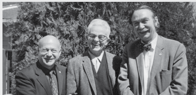
Arthur Rothstein, Roy Stryker, and Gifford Hampshire, 1972. DOCUMERICA director Gifford Hampshire was inspired by the New Deal-era Farm Security Administration photography project directed by Roy Stryker. During the 1970s, FSA photographer Arthur Rothstein served as an adviser to DOCUMERICA.

The Farm Security Administration/Office of War Information archive is held at the Library of Congress. It can be viewed online at http://memory.loc.gov/ammem/fsabhtml/fahome.html .