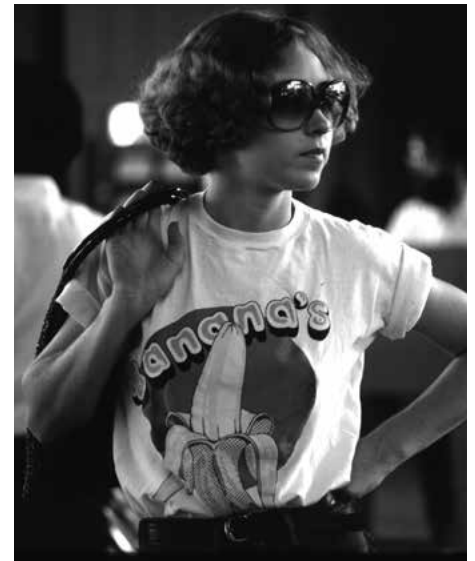
A Cincinnati, Ohio, auto inspection station was the setting for Lyntha Eiler's 1974 portrait of a young woman observing testing procedures.

and magazine articles—allow us to study in depth the project, its photographs, and its photographers.