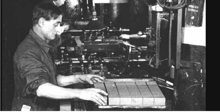
Left, top to bottom: A factory worker helps produce soap in Bubbles, I'm Forever Using Soap , 1919.