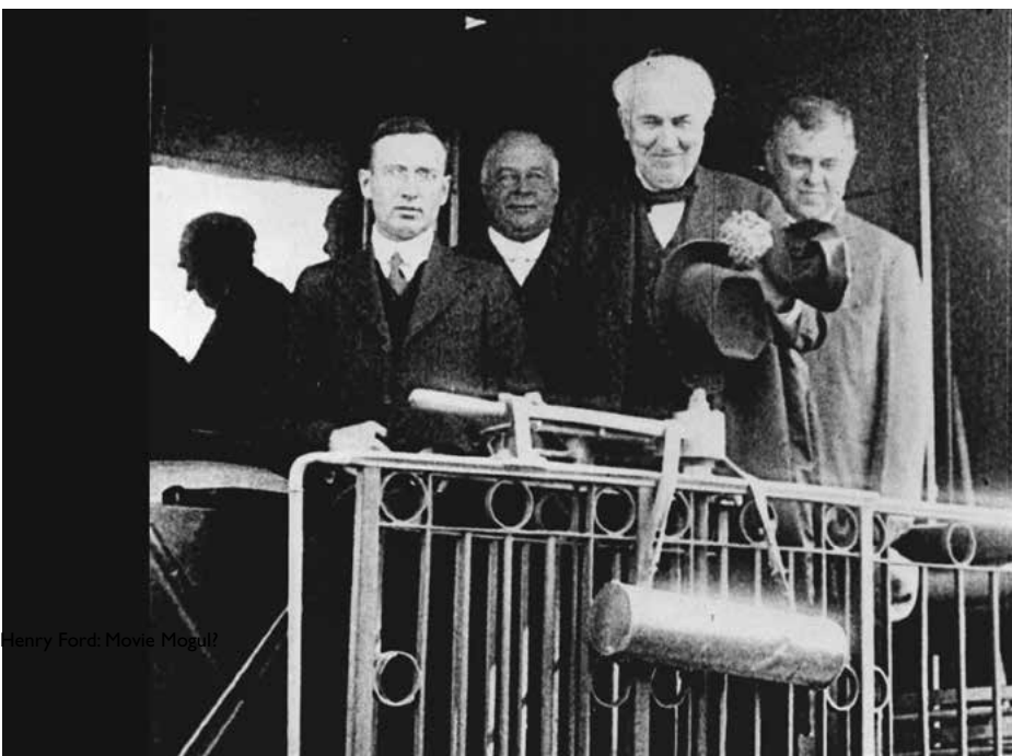
Henry Ford: Movie Mogul!

Continuing Henry Ford's focus on education, the newly formed Photographic Department, which combined motion picture and still photography operations, was directed to develop and produce the Ford Educational Library in 1920.