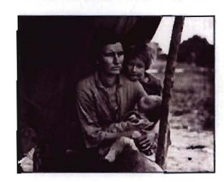
Dorothea Lange Migrant Mother. February 1936

Unemployment benefits aid begins. Line of men inside a division office of the State Employment Service office at San Francisco, California, waiting to register for benefits on one of the first days the office was open. January 1938