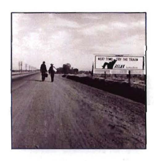
Dorothea Lange Toward Los Angeles, California. March 1937

"This Great Nation Will Endure": Photographs of the Great Depression