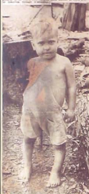
FOR THIS SHARECHOUSER'S CHILD said for the from rickers and maintaining there is been at a happy life in the better land to