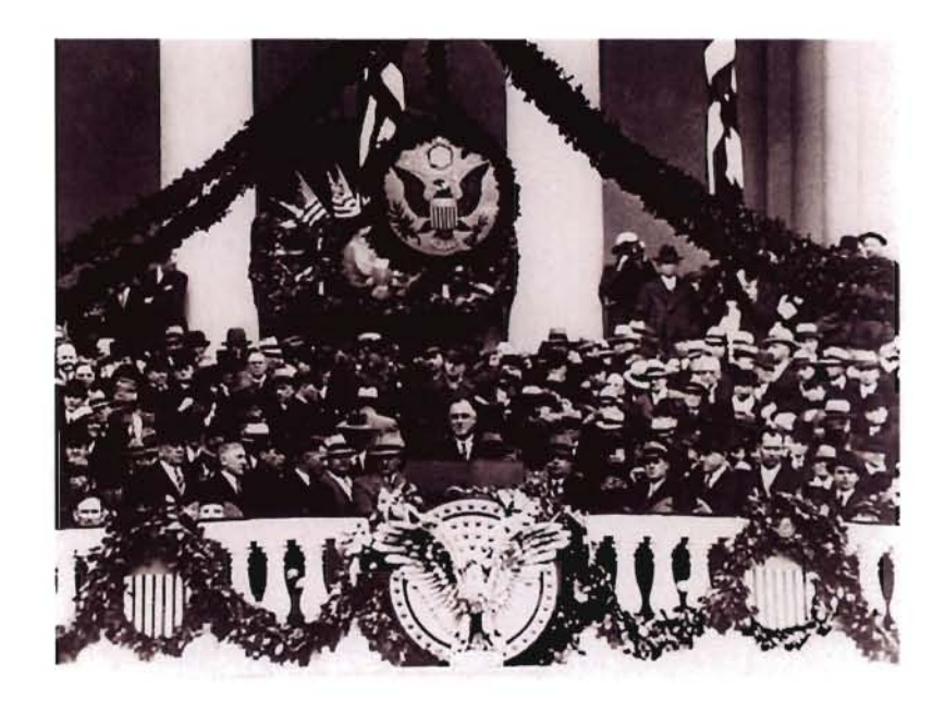
"This great nation will endure as it has endured, will revive, and will prosper..."