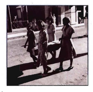
Funeral of a child, Ponce, Puerto Rico. January 1938