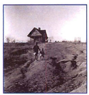
Children and old home on badly eroded land near Wadesboro, North Carolina.

"This Great Nation Will Endure": Photographs of the Great Depression