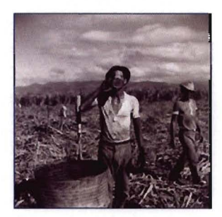
Edwin Rosskam Sugar workers taking a drink of water on a plantation, Ponce (vicinity), Puerto Rico. January 1938