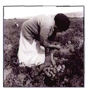
Mexican migrant woman harvesting tomatoes, Santa Clara Valley, California. November 1938