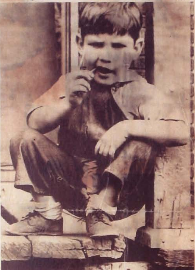
LUCKY—He's still not top of the forget the ways and the misery forced on some at these people by their liaffle is make a having from inhabitable and Modern schools and training