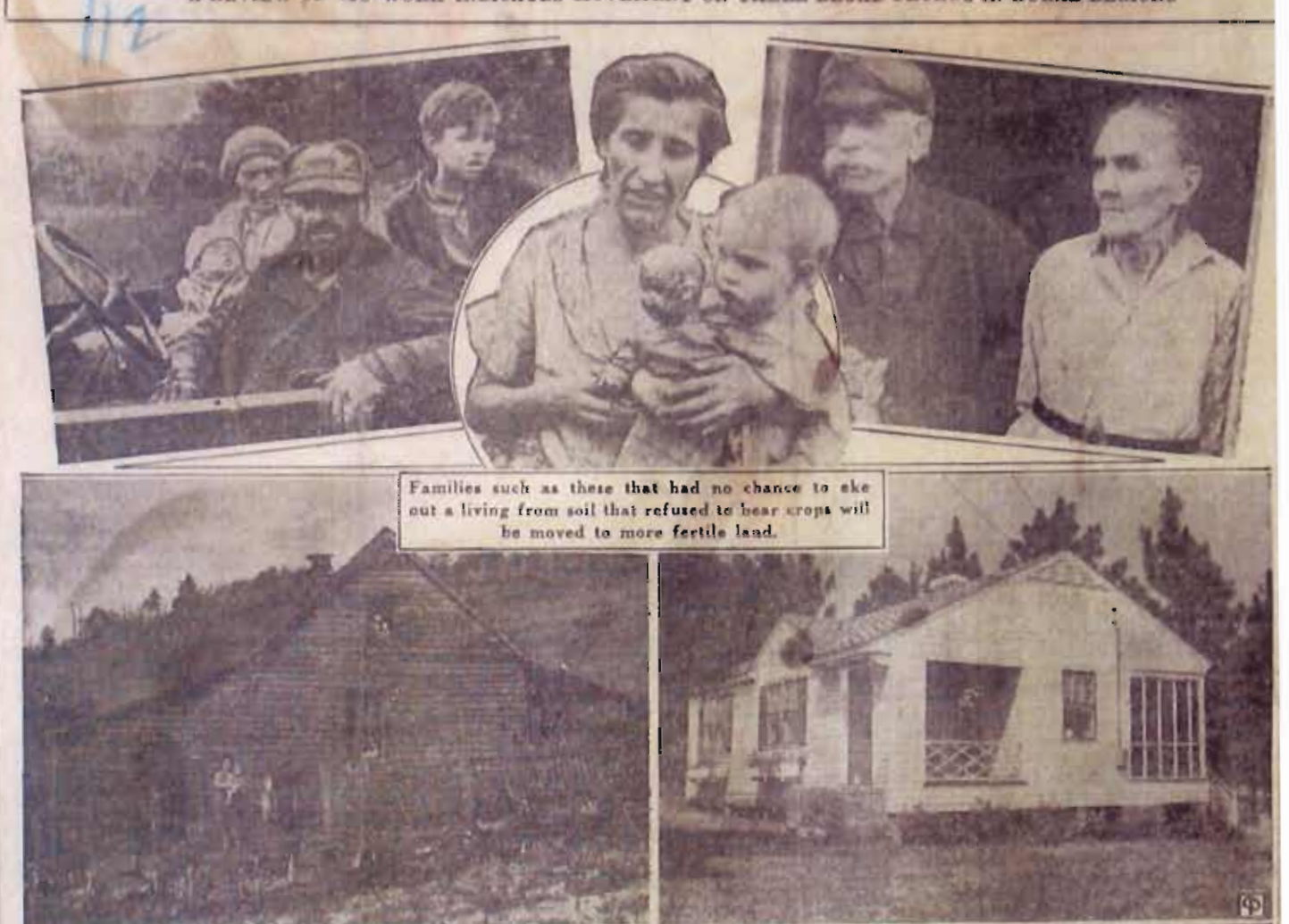
Left, this family will be moved into a new home, right, built by the U. S. Resettlement Administration.

A REVIEW OF ITS WORK INDICATES MOVEMENT ON THREE BROAD FRONTS IN RURAL REGIONS