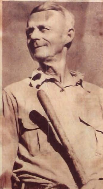
THE RESULT OF THE RESETTLEMENT PROCESSM.—This farms has been resettled on good land is beginning to enjoy life, looks don fadertly to the future with a smile on his face.