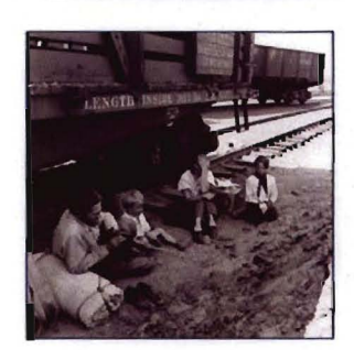
Family who traveled by freight train, Toppenish, Yakima Valley, Washington. August 1939