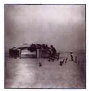
Arthur Rothstein Father and Sons Walking in the Face of a Dust Storm. April 1936