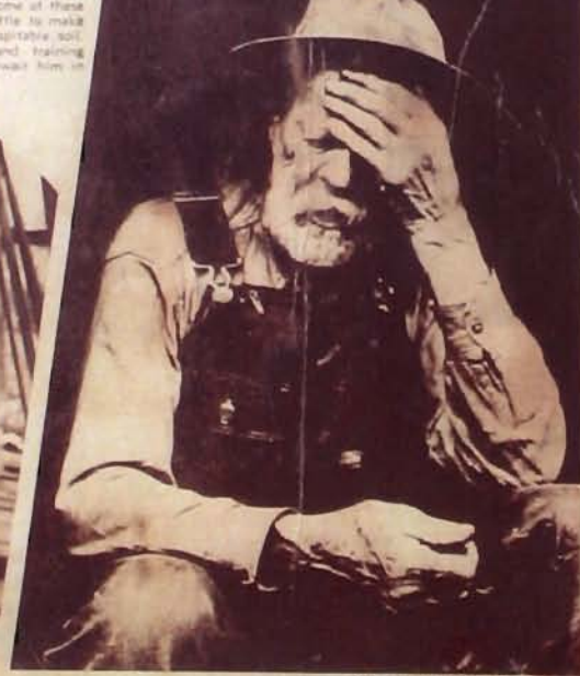
ALL HIS LIFE has been spent on barron tand, but now one of the few who have attained old age in the sub is being restriked on good farmland near Chillicothe, O at least will case to more wear-properties.