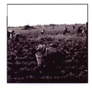
Arthur Rothstein Picking beans, Belle Glade, Florida. January 1937