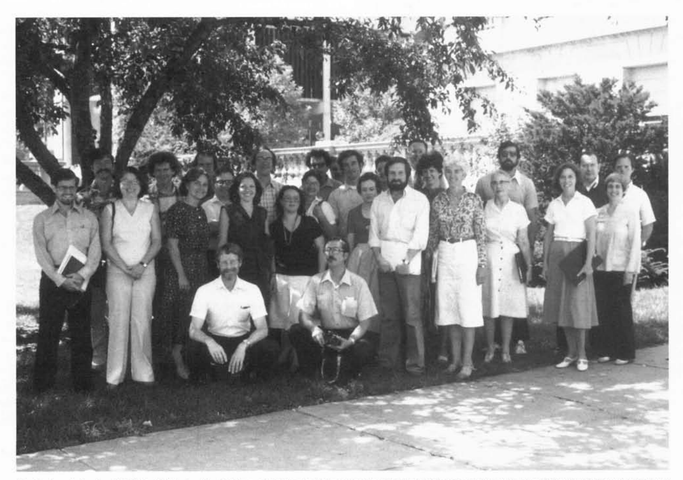
Participants in the 1979 Institute for the Editing of Historical Documents, Madison, Wisconsin. How many of the participants can you identify? A complete list appears at the bottom of page 4. The Institute is an important part of the NHPRC's educational commitment. Related stories begin on page 6.