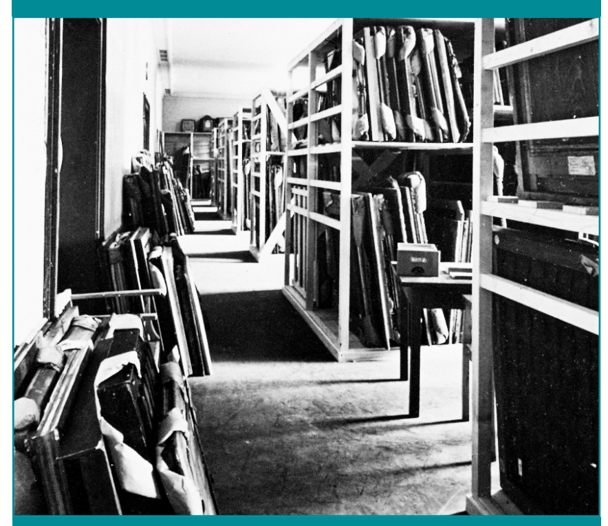
May 6-7, 2011