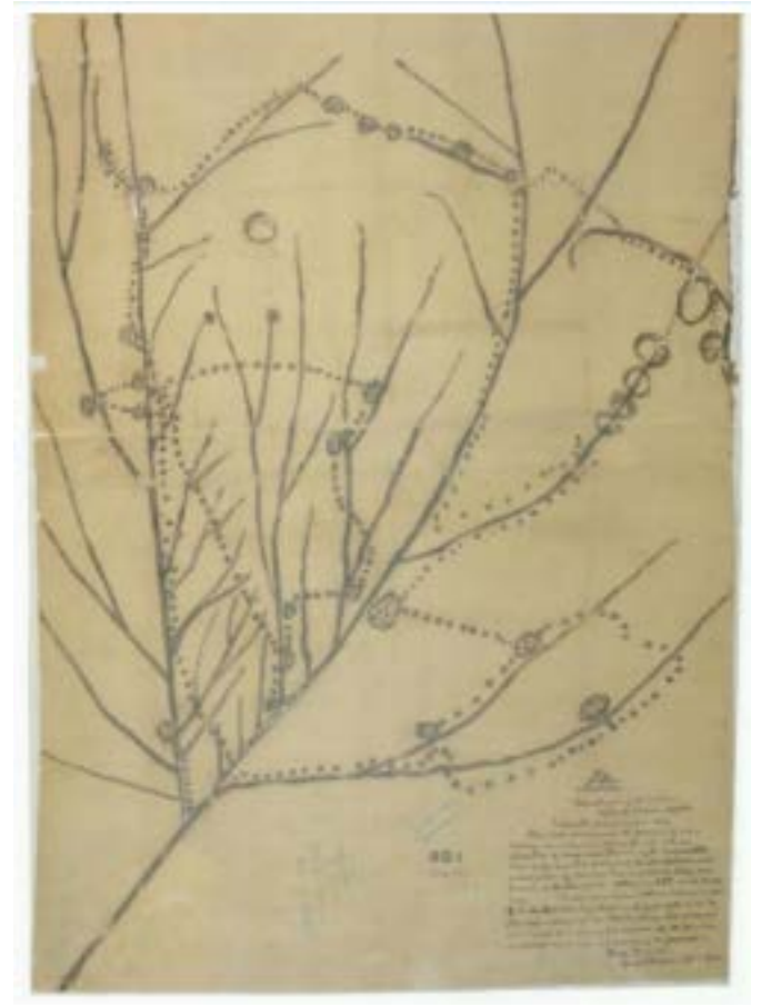
Map drawn by an unidentified Indian and presented by the Sac & Fox of the Mississippi and the Sac & Fox and Ioway of the Missouri in Council with the United States at Washington D.C. on October 7, 1837. National Archives. https://catalog.archives.gov/id/50926148

Federally Recognized Native Communities in Missouri (2018) As of 2018, there were no modern federally recognized Native communities in the state of Missouri.