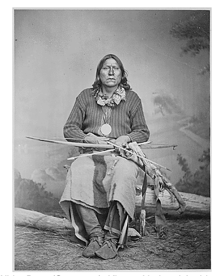
White Bear (Sa-tan-ta), Kiowa.

The Quapaw Tribe of Indians Sac & Fox Nation, Oklahoma The Seminole Nation of Oklahoma Seneca-Cayuga Nation Shawnee Tribe Thlopthlocco Tribal Town Tonkawa Tribe of Indians of Oklahoma United Keetoowah Band of Cherokee Indians in Oklahoma Wichita and Affiliated Tribes (Wichita, Keechi, Waco & Tawakonie), Oklahoma Wyandotte Nation