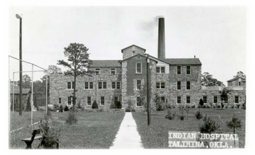
Indian Hospital, Talihina, Oklahoma, ca. 1914-ca. 1936.