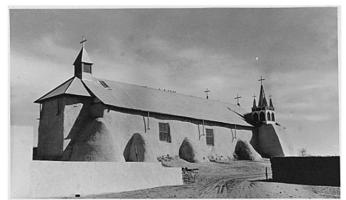
Mission Building at United Pueblos Agency, ca. 1939.