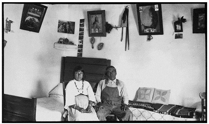
Pueblo Couple in their home, ca. 1935.

Zuni Tribe of the Zuni Reservation, New Mexico