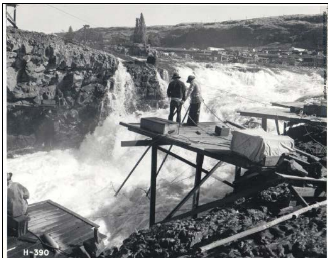
Celilo Falls, a group of majestic waterfalls between Washington and Oregon on the Columbia River was a major Native fishing area for all tribes on both sides of the river from ancient times until the Dalles Dam was constructed and the falls were inundated. Here fishermen stand on wooden platforms over the water with dipnets before 1952.