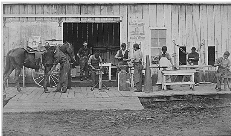
Class in blacksmithing, Forest Grove School, Oregon, 1882.