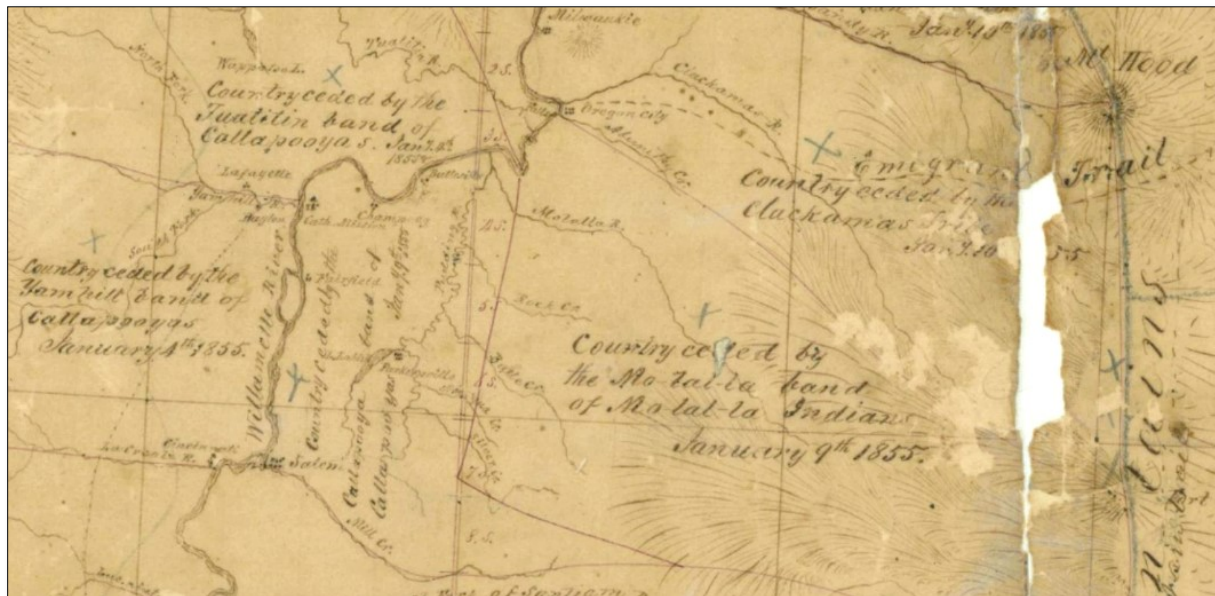
A small section of "Sketch map of Oregon Territory" (after 1855) showing an area in Western Oregon, near Portland, where land was ceded by individual tribes and bands before relocation to confederated (combined) reservations across the state. Map date unknown. National Archives. https://catalog.archives.gov/id/50926100