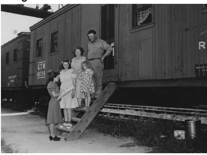
Original 1940 caption: A census enumerator takes information from a family living in a railroad car.

Since the opening of the 1930 Census in 2002, National Archives staff and patrons have anxiously awaited the availability of the 1940 U.S. Federal Census. The 1940 Census will open to the public on Monday, April 2, 2012, at 9:00 a.m. EST, 8:00 a.m. CST. This will be the first time that the Census will be accessible from any computer for free. During the initial months following its release, researchers will conduct their searches via enumeration districts as opposed to name indexes. Conducting successful searches will require some advanced planning. The National