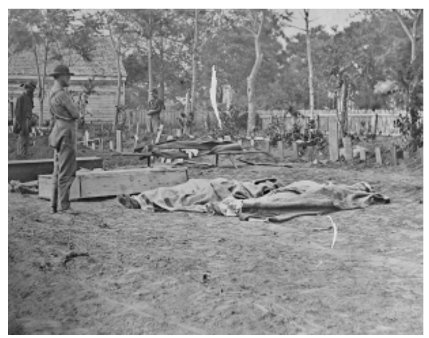
Burying the dead at Fredericksburg, Virginia. (111-B-71)

Another good series to consult is the Applications of Headstones in Private Cemeteries, 1909–1924, found in RG 92, entry 592. The headstone applications were often completed by superintendents of cemeteries and therefore do not contain next-of-kin information. Although the starting date of the series is 1909, many applications were submitted for veterans already buried in cemeteries prior to 1909. Like the card records of headstones, applications can also be found for veterans of earlier conflicts.