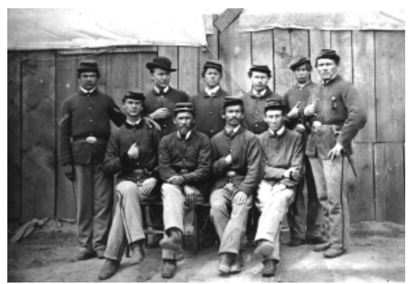
Union soldiers from the Army of the Cumberland awaiting court-martial. (111-B-2738)

Plante, Trevor K. "The Shady Side of the Family Tree: Civil War Union Court-Martial Case Files," Prologue , Winter 1998, Vol. 30, No. 4.