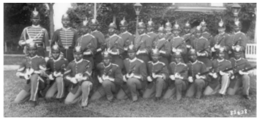
Soldiers of Company I, 25th U.S. Infantry, at Fort Snelling, Minnesota, taken in the 1880s. (111-SC-83638)

The place to start researching black regulars is Regular Army Enlistment Papers, 1798–1912, RG 94, entry 91. This series is arranged alphabetically by name of soldier and generally shows the soldier's name, place of enlistment, date of enlistment, by whom enlisted, age, place of