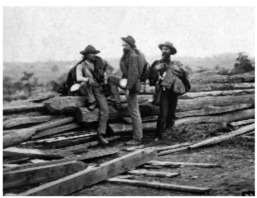
Confederate prisoners standing along a fence in Gettysburg, Pennsylvania. (200-CC-2288)

If you are researching a Confederate soldier, sailor, or marine who was captured during the war consult prisoner-of-war records found on M598, Selected Records of the War Department Relating to Confederate Prisoners of War, 1861-1865. This microfilm publication contains lists and registers of prisoners of war and records related to individual prisons or stations. Records related to all prisoners include: registers of prisoners; registers of deaths of prisoners (compiled by the Office of the Commissary General of Prisoners); registers of prisoners' applications for release and decisions; registers related to release of prisoners; registers relating to prisoners' possessions; and registers of deaths of prisoners (compiled by the Surgeon General's Office). These records are followed by the records of individual prisons or stations including Alton, Illinois; Bowling Green, Virginia; Camp Butler, Illinois; Camp Chase, Ohio; Cincinnati, Ohio; Fort Columbus, New York; Department of the Cumberland; Fort Delaware, Delaware; Camp Douglas, Illinois; Elmira, New York; Gratiot and Myrtle Streets Prisons, St. Louis, Missouri; Department of the Gulf; Hart Island, New York; Hilton Head, South