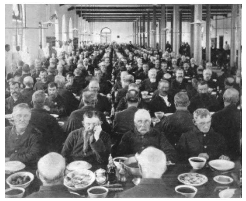
Veterans in the dining hall of the National Home for Disabled Volunteer Soldiers in Marion, Indiana, in the late 1890s.

The home registers have been reproduced as M1749, Historical Registers of National Homes for Disabled Volunteer Soldiers , 1866–1938. This microfilm publication is available at the National Archives Building in Washington, DC, and many of the National Archives regional facilities. Some of the regional sites have all of the microfilm rolls covered under