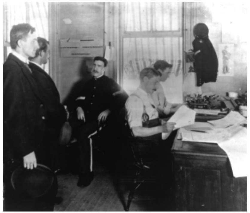
Recruits wait while clerks fill out Army enlistment papers, ca. 1898. These papers are found in entry 91, Enlistment Papers, RG 94, Records of the Adjutant General's Office.

For medical information, consult carded medical records found in RG 94, entries 529 and 530 covering the years 1821–85 and 1894–1912 respectively. These cards relate to Regular Army personnel admitted to hospitals for treatment and may include information such as name, rank, organization, age, race, birthplace, date entered service, cause of