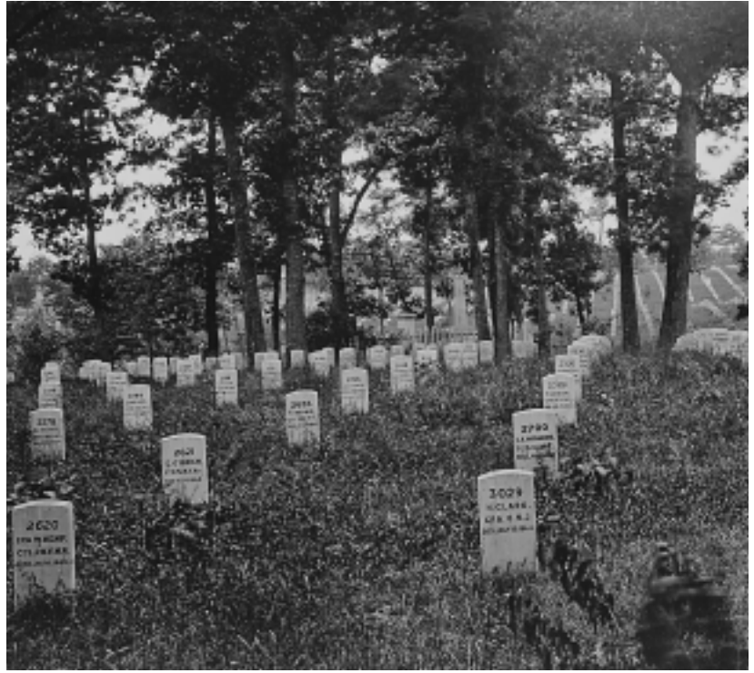
Civil War view of Arlington National Cemetery. (111-B-5304)

More than 40 years after the end of the Civil War, permanent, uniform markers were authorized for the graves of Confederate soldiers buried in national