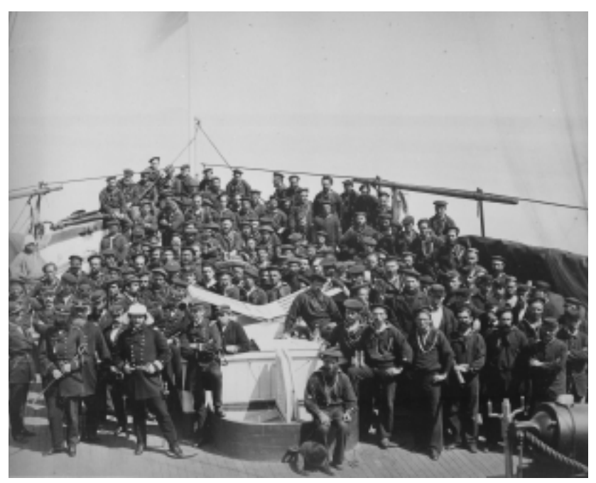
Officers and crew of the USS Monocacy, during the 1871 expedition to Korea.

class. Consulting the dictionary is important for several reasons. It is important to verify that the ship was in fact a U.S. Navy vessel and to verify dates of service. Before conducting a search in ship-related records make sure you have information on the correct vessel. Several ships served at different times under the same name, so first consult the Dictionary of American Naval Fighting Ships to find the dates of service of the vessel you are researching.