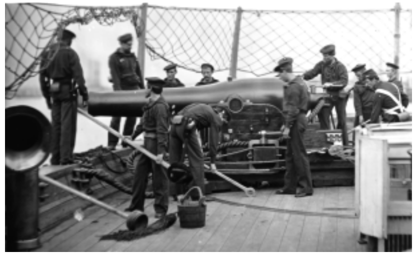
Crew working the gun on a Civil War Navy gunboat. (111-B-486)

ment data, and a summary of service. The series is arranged chronologically.