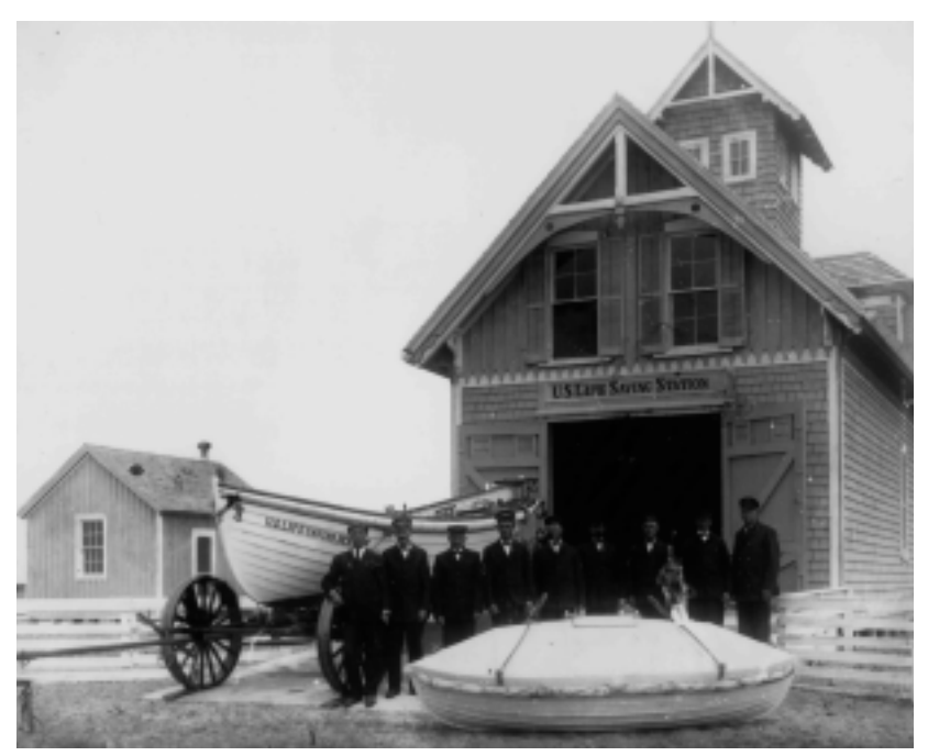
Surfmen with their lifeboat equipment in front of a U.S. Life Saving Station in North Carolina in the late 1800s. Records of the U.S. Coast Guard (RG 26) include records of predecessor agencies such as the U.S. Life-Saving Service. (26-CGS-66-02-01)

The records relating to enlisted crew members of the Revenue Cutter Service include muster rolls, payrolls, and shipping articles. In one series of muster rolls are unbound monthly reports, 1848–1910, arranged by name of vessel and thereunder chronologically. They are not indexed, so they can be searched only by name of vessel and the individual's approximate date of service. Muster rolls and payrolls show the name, and, when appropriate, signature or mark of each crew member. The muster rolls for the Revenue Cutter Service/Coast Guard, 1833–1932, provide name, rating, date and place of enlistment, place of birth, age, occupation, personal description, and number of days served during the reported month for each crew member, along with notes if the crewman was detached, transferred, discharged, deserted, or died during the report period. The records are arranged alphabetically by name of vessel.