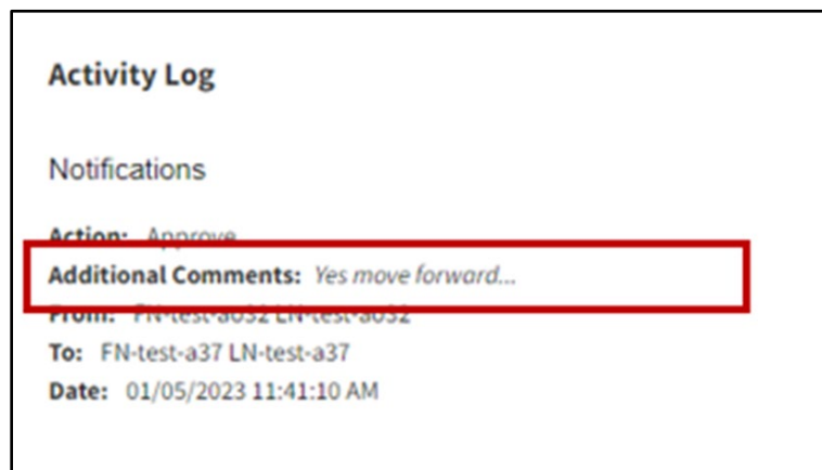
Figure 5 Sample Comments for an Approved Transfer Request