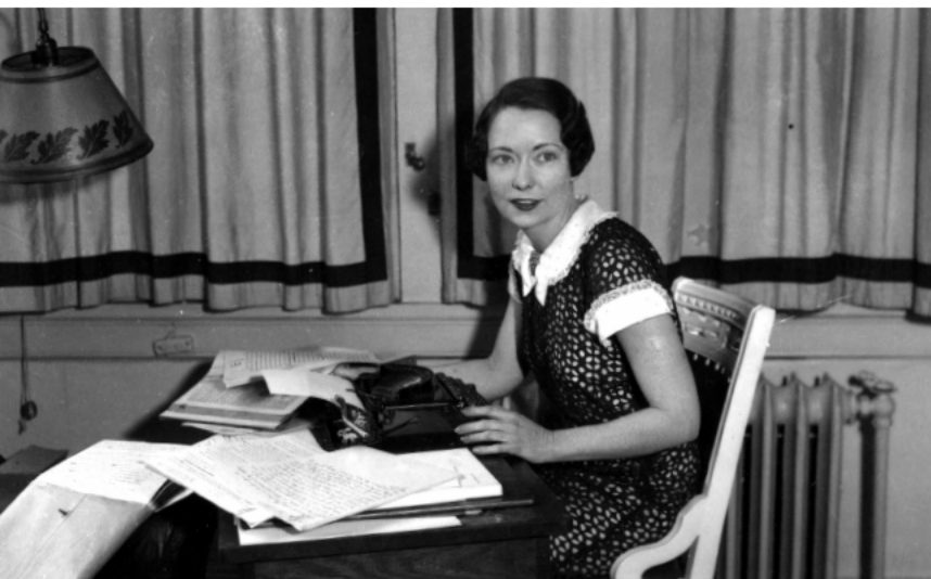
Mrs. Margaret Marsh (above), writing under the name Margaret Mitchell, published Gone With the Wind in 1936. Her 1930 Census entry (top) indicates “none” for her occupation.