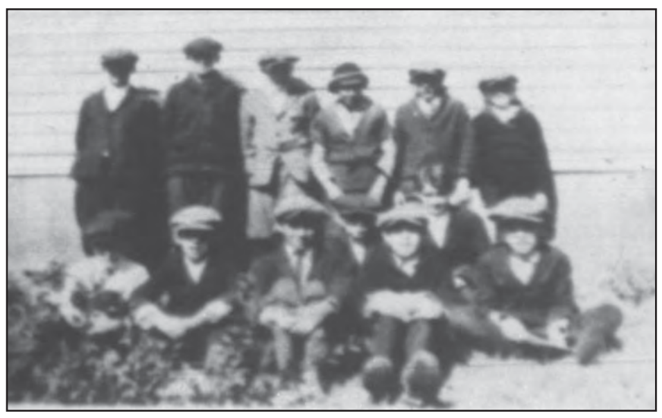
Boys Club at Clifton, Virginia (1925). T893, Roll 17.