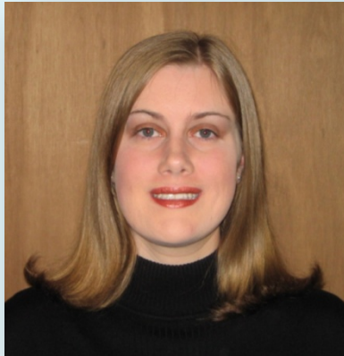
Archives Specialist National Archives Washington, DC