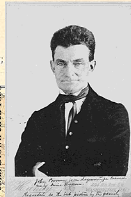
John Brown circa 1850