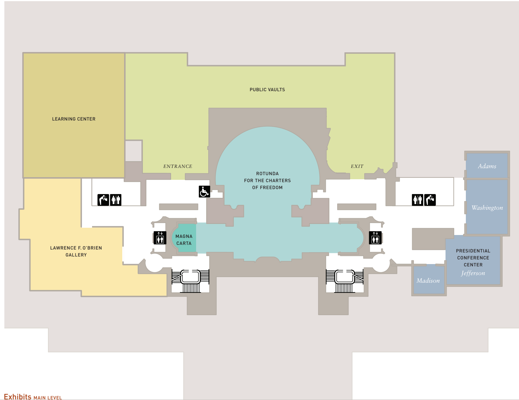
Exhibits MAIN LEVEL