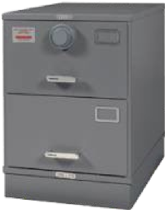
RED Label Class 6 GSA-approved Container