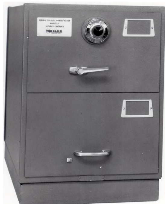
BLACK Label Class 3 GSA-approved Container