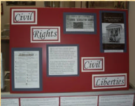
The Civil Rights/Civil Liberties exhibit examined several prominent court cases held in the National Archives - Central Plains Region.

The Central Plains Region offers small, temporary exhibits in the lobby area. Exhibits use facsimile copies of original records held by the region in order to protect the original documents from harmful ultraviolet light. All of our exhibits are designed to educate visitors about the records we hold and how they may be of use to them. Exhibits are changed every two to three months and focus on a variety of topics. Call (816) 268-8071 for the exhibit schedule.