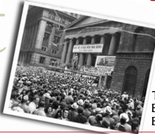
A View of the Rally on the Steps of the Sub-Treasury Building, WWI Bond Drive.

Citation: Records Relating to Bond Promotion; General Records of the Department of the Treasury, RG 56; NARA's Northeast Region, (New York).