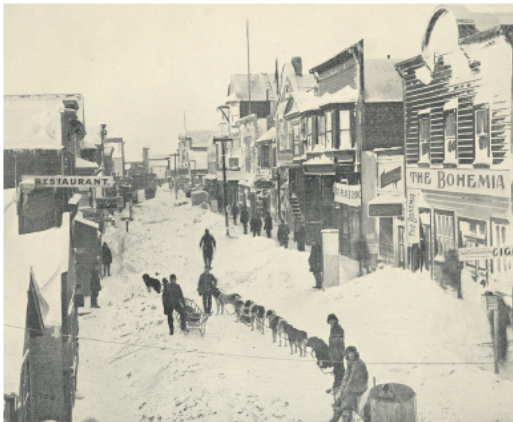
"Winter scene, Front Street, Nome [Alaska]" (Photographer Eric A. Hegg)," ca. 1905, Photographs of the Inhabitants of Metlakatla, AK (ARC Identifier 297759) NARA's Pacific Alaska Region, Anchorage

The Nome Gold Rush ended in September 1900, three months after it began. Gold discoveries lured people to Nome for another 10 years. Nome’s mystique of being a rough and ready frontier town still captures the public imagination of Alaskans and tourists. The 1,000-mile Iditarod Sled Dog Race from Anchorage to Nome is a reminder that Nome is not a forgotten place, and gold mining continues at Nome today.