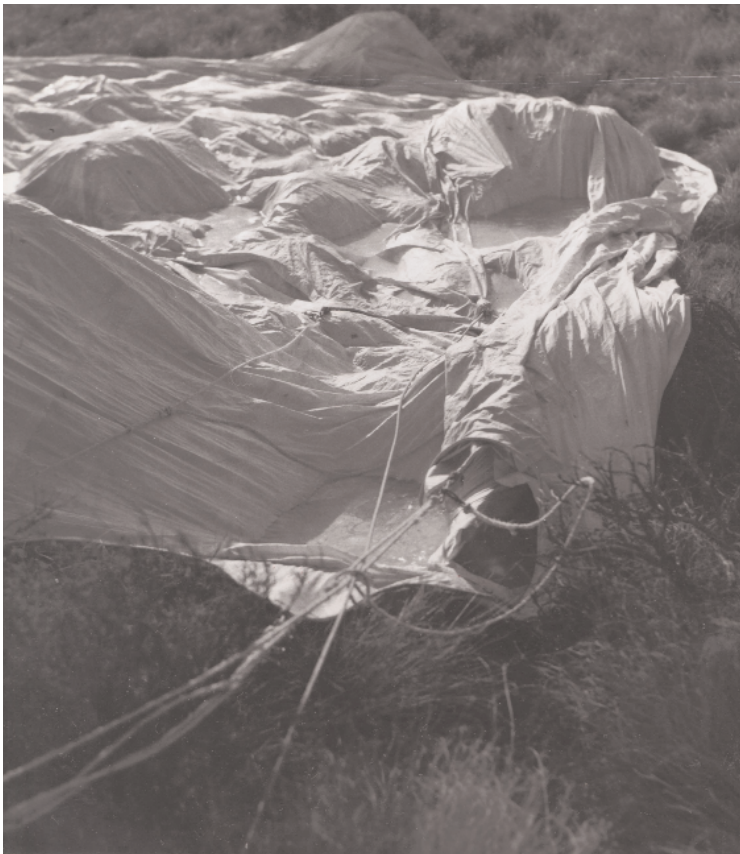
Above left: Prossor Balloon—Section of bag, as found. (Note ice that has formed.)

Prompted by the Doolittle Air Raid on Tokyo in April 1942, the Japanese military developed an unmanned balloon bomb offensive as a means of direct reprisal against the U.S. mainland. The balloons, made of paper or rubberized silk, carried antipersonnel and incendiary bombs. Japan launched some 9,000 balloons during a five-month period, to be carried by high-altitude winds more than 6,000 miles eastward across the Pacific to North America. Perhaps a thousand of these reached this continent, but there were only about 285 reported incidents. Most