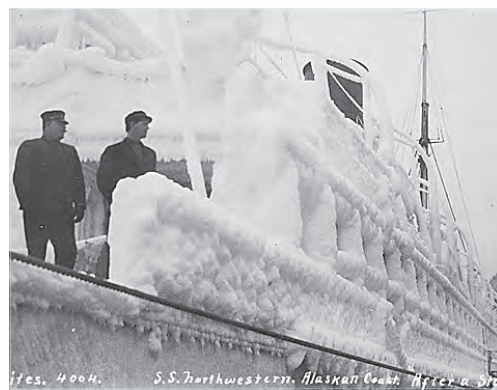
ifes. 4904. S.S. Northwestern. Alaskan Coast. After a storm.