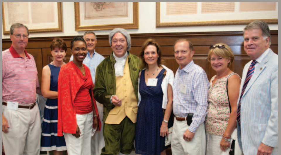
ARCHIVIST DAVID S. FERRIERO (RIGHT), AND HISTORICAL RE-ENACTOR HOST GUESTS AT THE JULY 4TH BREAKFAST.