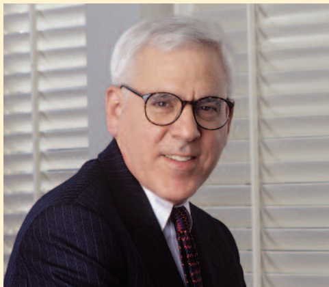
DAVID M. RUBENSTEIN