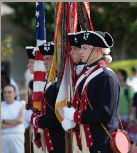
JULY 4TH AT THE NATIONAL ARCHIVES