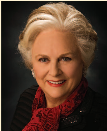
JACQUELINE BADGER MARS

A lifelong businesswoman, philanthropist, and advocate for women's education, Ms. Mars was