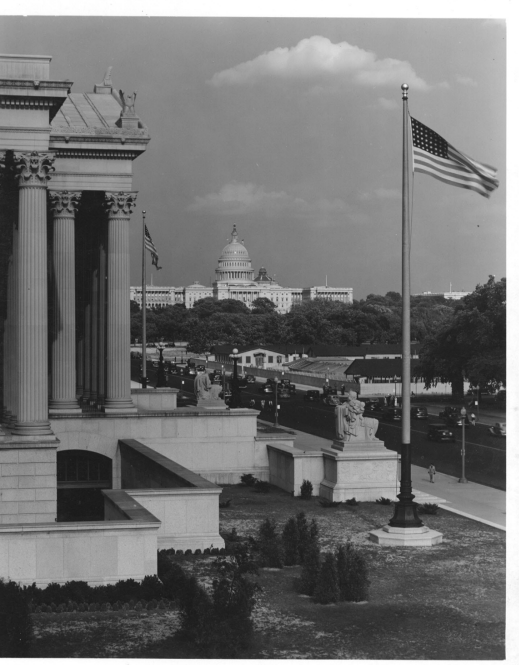
National Archives Identifier 7820630