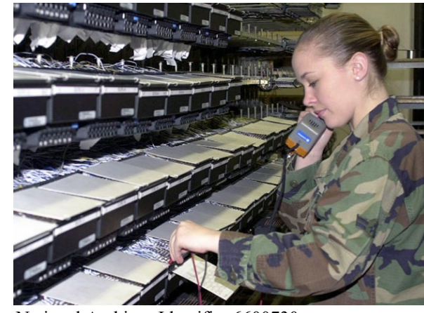
National Archives Identifier 6600730

We are also streaming at youtube.com/usnationalarchives