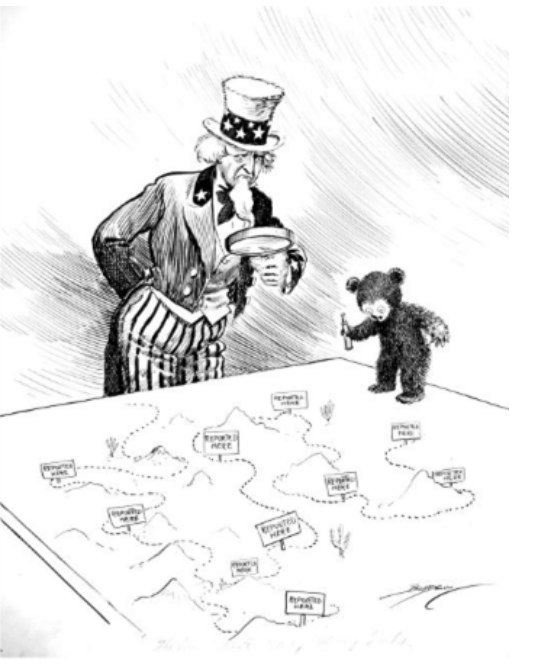
National Archives Identifier 6011170