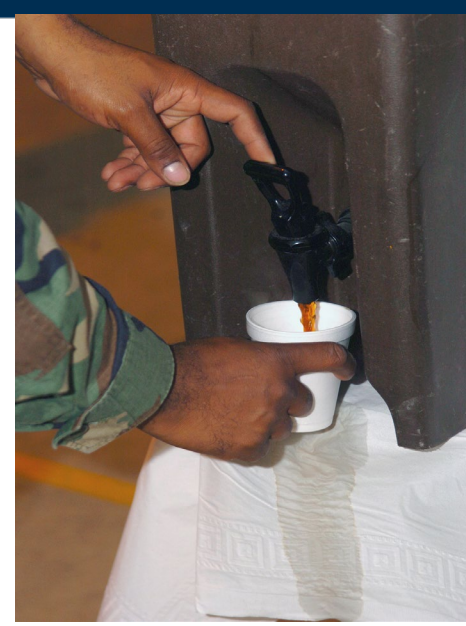
National Archives Identifier 6656626

https://www.archives.gov/ogis/foia-advisory-committee/2020-2022-term/meetings