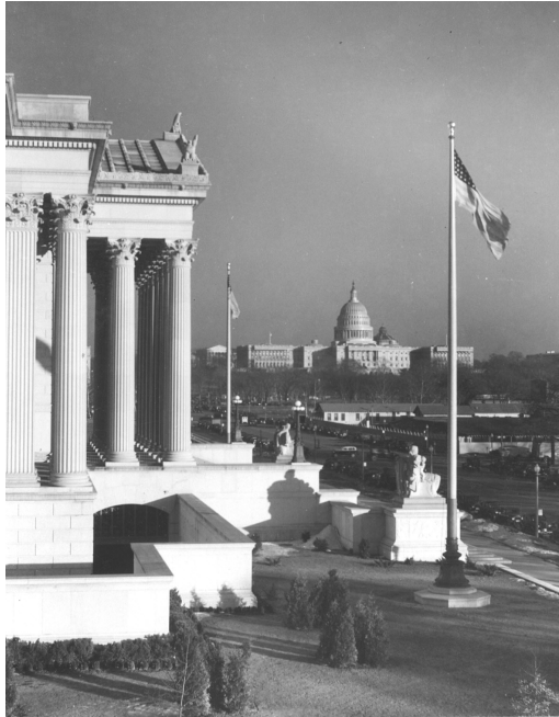
National Archives Identifier 7820533