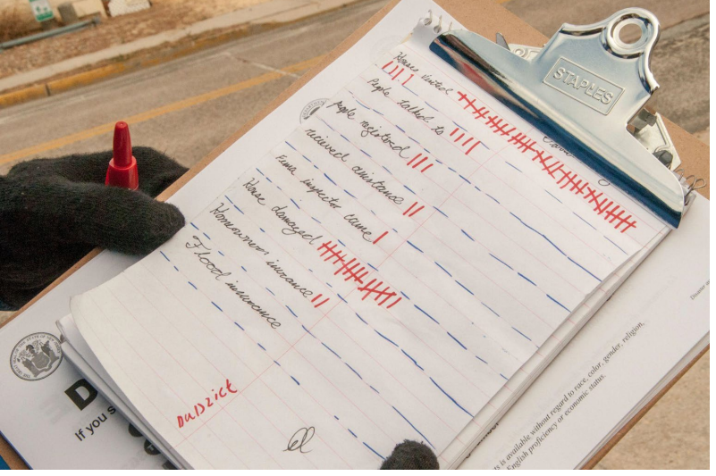
National Archives Identifier 24472221