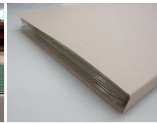
Documents properly aligned in folder