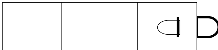
Figure 2 – Inside of base of box showing pull cord