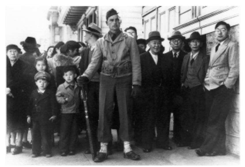
A crowd of onlookers on the first day of evacuation from the Japanese quarter in San Francisco (210-GC-426).

The 10 centers were located in Central Utah, Topaz, UT; Colorado River, Poston, AZ; Gila River, Rivers, AZ; Granada, Amachie, CO; Heart Mountain, Heart Mountain, WY; Jerome, Denson, AR; Manzanar, Manzanar, CA; Minikoda, Hunt, ID; Rohwer, McGehhe, AR; and Tule Lake, Newell, CA.