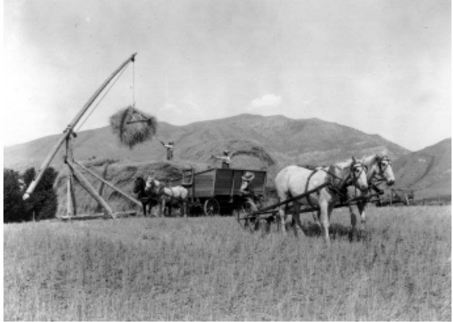
Unloading dry farm wheat (33-SC-5094c).

Nonpopulation decennial census schedules consist of agricultural, industrial and manufacturers, mortality, and defective, dependent, and delinquent classes (1880 only) as well as social statistics. The Bureau of the Census did not take all of these censuses in all years.