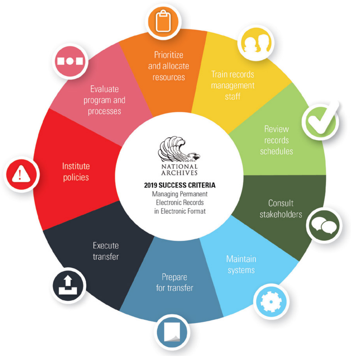
Figure 2: Operational Activities Wheel

your agency's records management program. Due to the variances in size, structure, culture, and other factors, agencies may need to incorporate additional activities to meet their business needs.