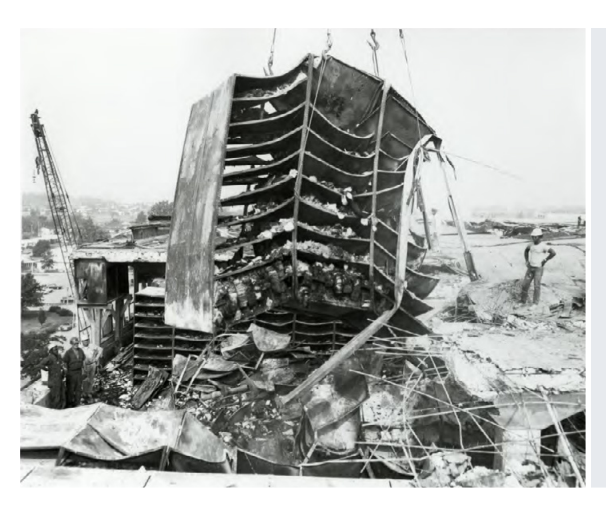
FIGURE 1. Aftermath of the 1973 fire at the National Archives, Military Personnel Records facility, in St. Louis, Missouri. Photo shows shelving being pulled from the damaged building. This disastrous fire destroyed approximately 16-18 million Official Military Personnel Files. There were no duplicate copies, no microfilm copies, and no indexes created prior to the fire. - Prologue, July 16, 2013 and NARA website

Consider regional differences when evaluating risks. Federal agencies located on the East coast and along the Gulf coast of the United States must consider the potential impact of hurricanes on their operations and their