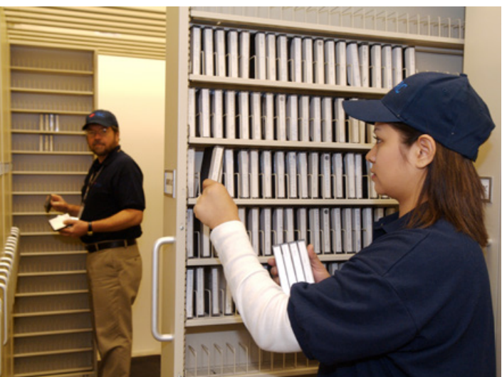
FIGURE 3. As an important lesson learned from Hurricane Katrina in 2005, NARA designed and built an Electronic Records Vault (ERV) for storing Federal agency essential records away from the most disaster prone areas of the country. The ERV is a secure, controlled access, environmentally controlled storage unit for Federal agencies' essential electronic records.