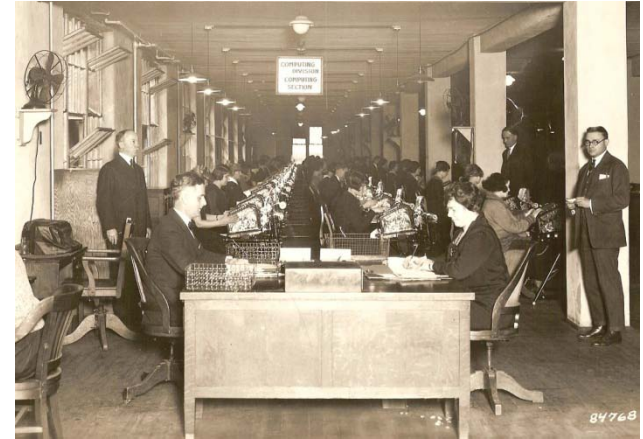
Veterans Bureau 1929