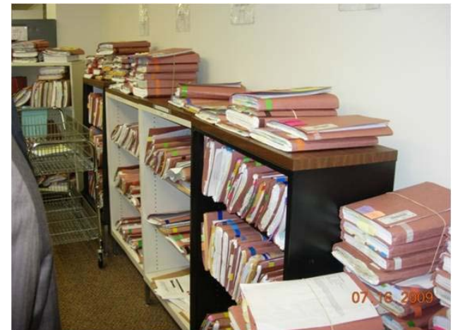
VBA Regional Office 2009