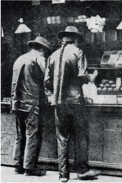
Early 20th century newsphoto taken in San Francisco's Chinatown, showing a Chinese man with his hair braided in a 'queue.'