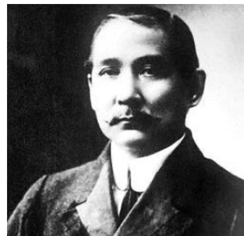
Dr. Sun Yat Sen, founder of the Chinese Republic