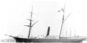
Logbook fragment of the U.S. revenue cutter Rush (1874-1912), whose logbooks have been digitized and their historic weather observations transcribed by volunteers. Also shown: Rush at anchor, n.d.