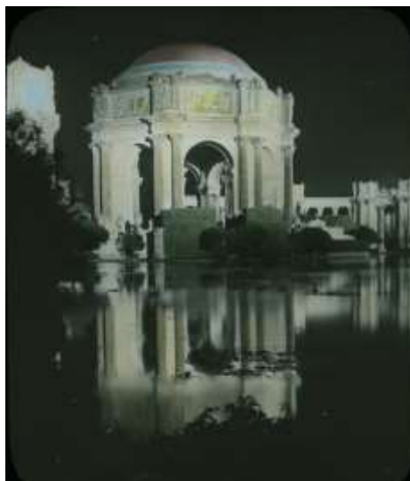
Palace of Fine Arts Building at the Panama-Pacific International Exposition, 1915. Local ID: 16-SFX-46.

This article is based on a posting by Richard Green in the Unwritten Record Blog. Exploring History with the National Archives Special Media Division at http://unwritten-record.blogs.archives.gov/2015/12/03/a-fair-to-remember-colored-lantern-slides-at-the-1915-panama-pacific-international-exposition