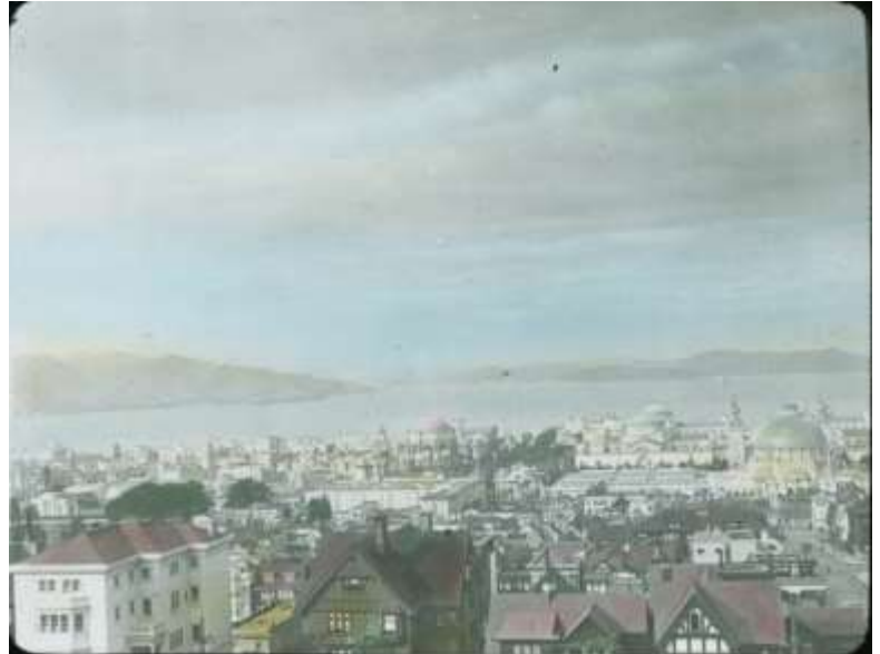
International Exposition from the Hills of San Francisco, 1915. Local ID: 16-SFX-35.