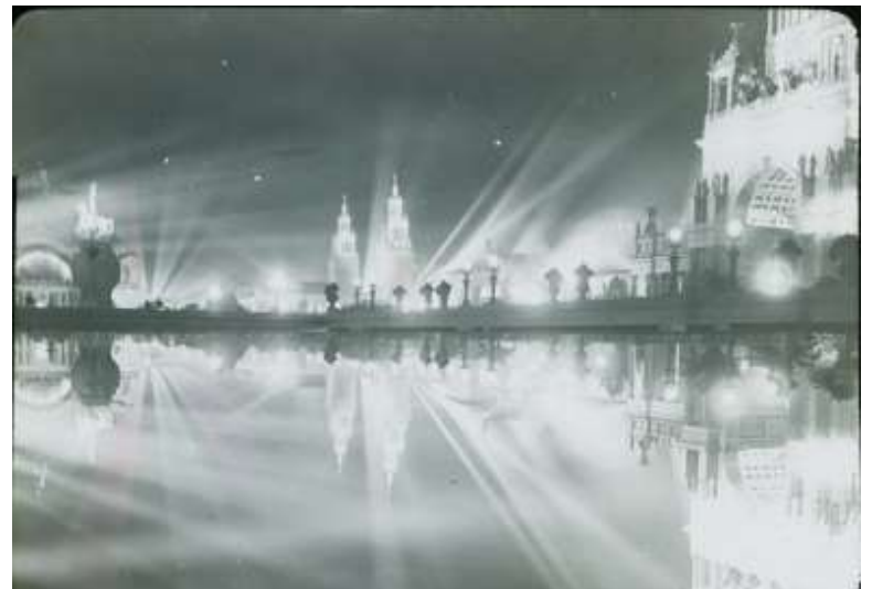
International Exposition at night. 1915. Local ID: 16-SFX-79