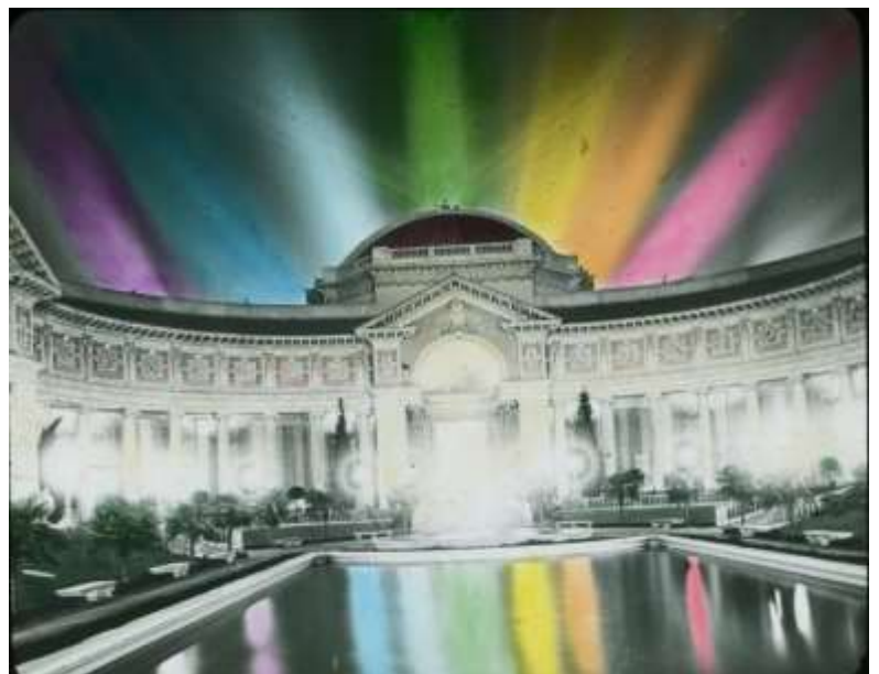
International Exposition at night, 1915. Local ID: 16-SFX-85