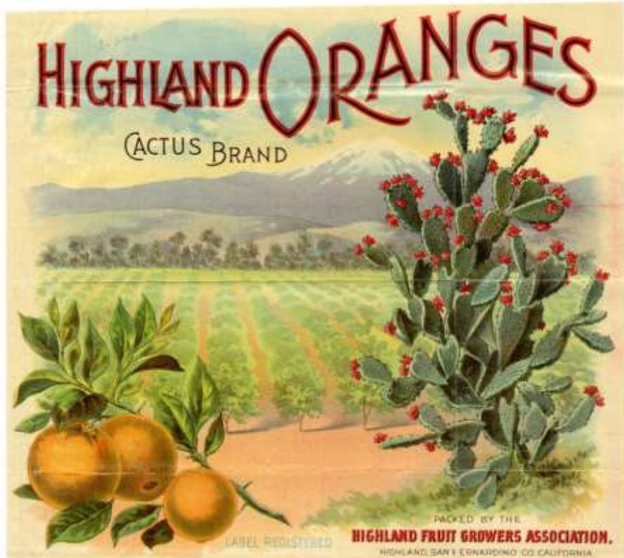
California Secretary of State's Office, Old Series Trademark No. 2688, January 2, 1896