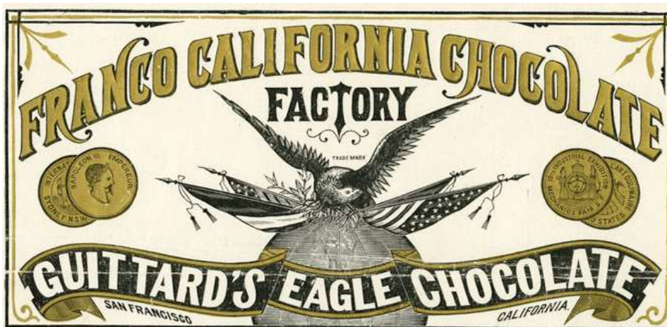
California Secretary of State's Office, Old Series Trademark No. 1865b, August 18, 1890