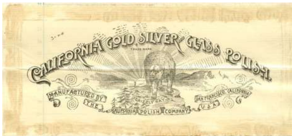
California Secretary of State's Office, Old Series Trademark No. 1868b, August 22, 1890