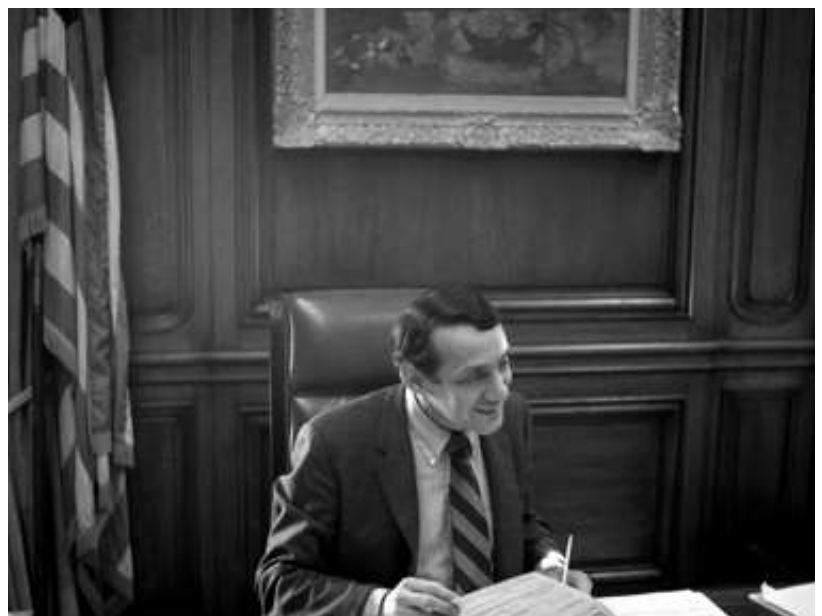
Harvey Milk at work in San Francisco