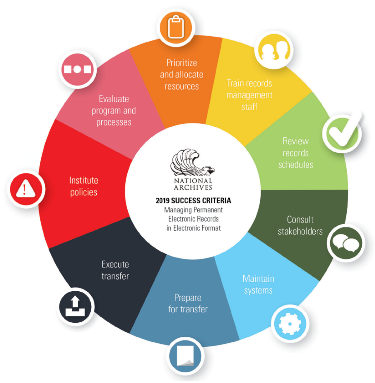
Figure 2: Operational Activities Wheel

your agency's records management program. Due to the variances in size, structure, culture, and other factors, agencies may need to incorporate additional activities to meet their business needs.