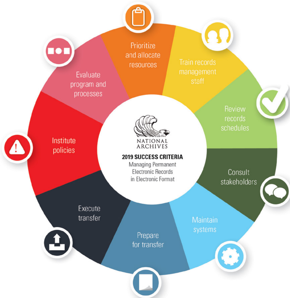
Figure 2: Operational Activities Wheel

your agency's records management program. Due to the variances in size, structure, culture, and other factors, agencies may need to incorporate additional activities to meet their business needs.