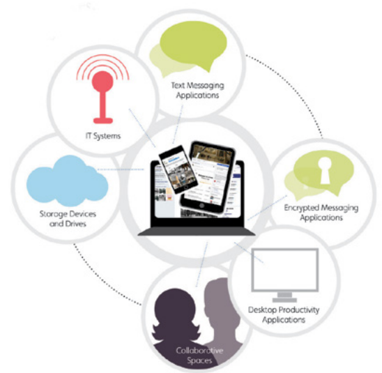
Figure 1: Location for Electronic Records

This document also includes a crosswalk for these three sections demonstrating the relationship between them to clarify how these products assist agencies on a path to success.