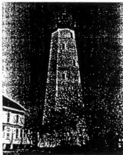
SANDY HOOK LIGHTHOUSE

No matter who owned the lighthouse, the early lighthouse keepers had to maintain the light every night all year long in all kinds of weather. The original light was probably provided by copper whale oil lanterns, each holding a number of wicks. The oil had to be carefully carried up the stairs to fill the lamps. Other types of lighting apparatus and illuminants were used until 1856-57, when the lighthouse was fitted with a third order Fresnel lens. The glass prisms of a Fresnel lens concentrated the light of the lamp in its center to produce a very bright, narrow beam. A few years later the inside of the tower was lined with brick, and an iron spiral staircase was added. Few structural changes were made to the exterior of the lighthouse tower over the past two hundred years.