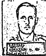
Photo taken circa 1945 after return to U.S. as wounded POW