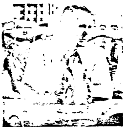
Lt. Governor Ed Reinecke