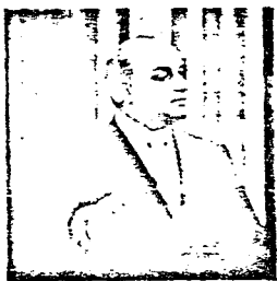
S.F. Mayor Joseph Alioto