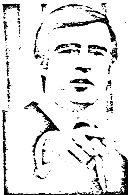
Secretary of State Edmund G. Brown, Jr.