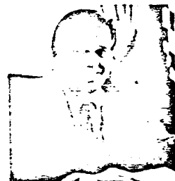
Congressman Jerome Waldie