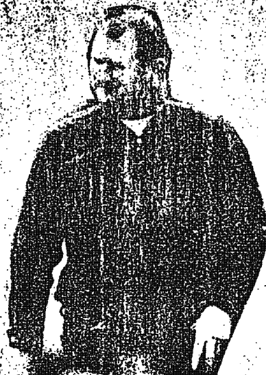
Comm. Exh. 237